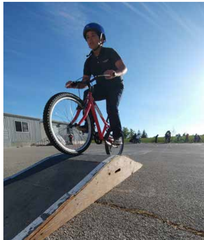
A student practices his balance during the last day of Ride Smart at St. Marguerite d'Youville Catholic Elementary School Road School

WE NEED ABOUT 4-6 BIKE DRIVES PER YEAR TO MEET OUR DEMAND FOR REFURBISHED BIKES