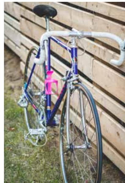
One of the 500+ donated bikes that was received in 2017.