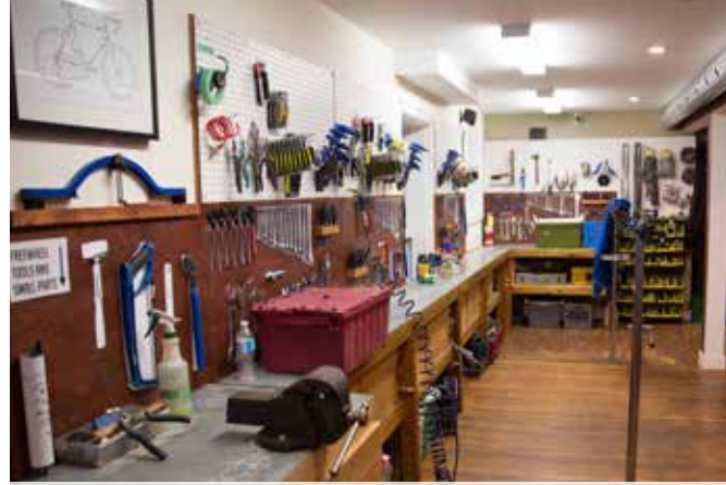
Current workshop space at 1422 Main St. E. A new location will allow more repair space.

Our store front has always provided everyone with access to professional quality repair tools, and knowledgeable staff available to further each person's repair skills. Tool usage and stand time is available on a pay what you can sliding scale of $0-10/hr. In 2018 we will be seeking out a new long term home for New Hope Community Bikes with more space for workshops, volunteer workers, improved accessibility and a convenient location.