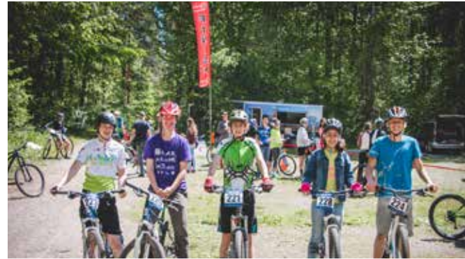
Students at OFSAA Mountain Bike Event Spring 2017

The idea of a bike drive is simple, pick a day, a location and a way to let people know it's happening, then collect bikes that people no longer need! We can arrange to have bikes picked up and will refurbish them into affordable transportation.